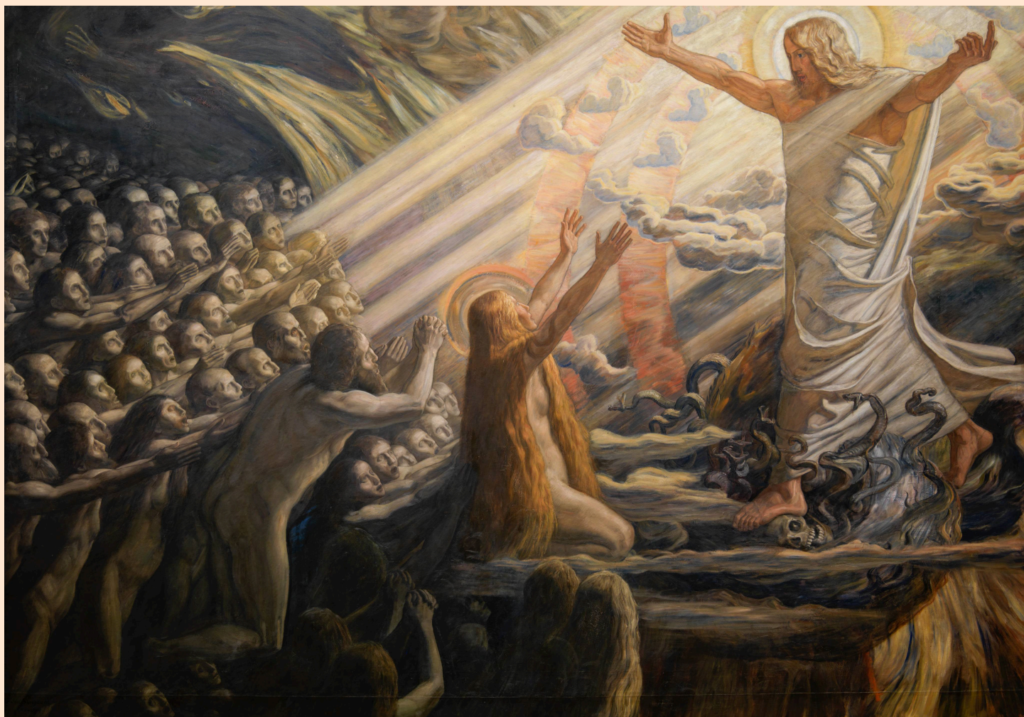
Christ in the Realm of the Dead, Joakim Skovgaard, 1891-1894, SMK - Statens Museum for Kunst, Kobenhavn, Denmark.

Philip said to him, "Master, show us the Father, and that will be enough for us." - John 14:8