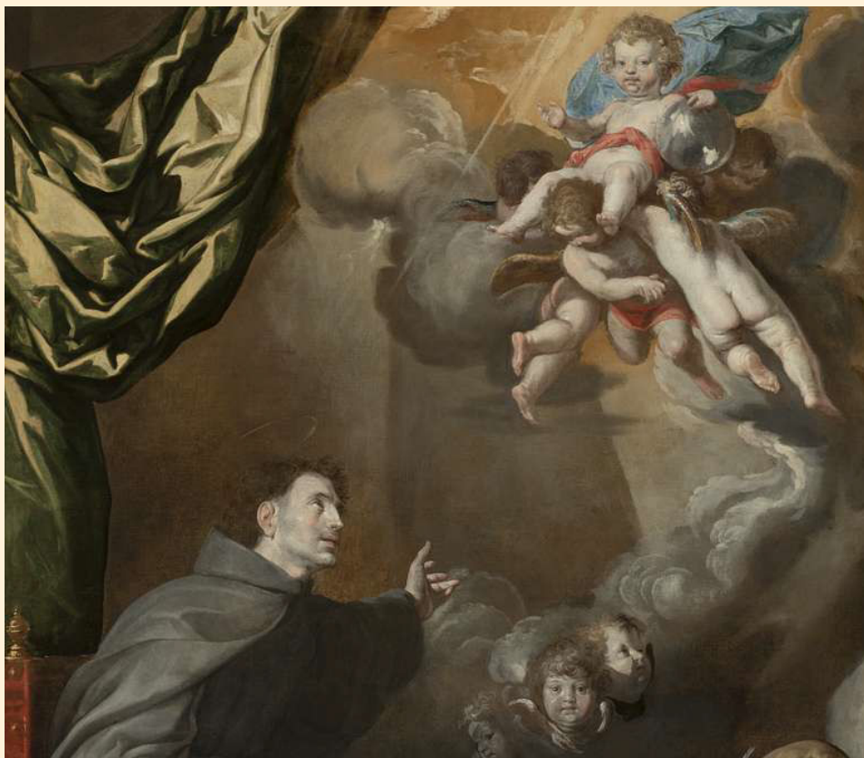
The Apparition of Jesus Child to Saint Anthony, Antonio del Castillo Saavedra, 1650/1655. Museo de Bellas Artes de Córdoba, Córdoba, Spain.

Philip said to him, "Master, show us the Father, and that will be enough for us." - John 14:8