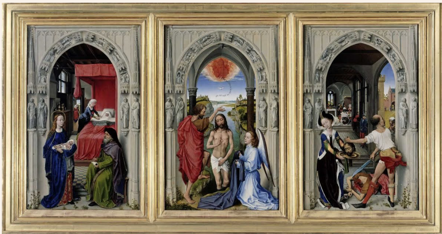
The Altar of St. John Rogier van der Weyden around 1455, Gemäldegalerie, Staatliche Museen zu Berlin, Berlin.

Philip said to him, "Master, show us the Father, and that will be enough for us." - John 14:8