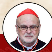
Cardinal Anders Arborelius, OCD