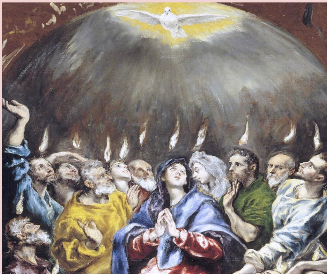
The Pentecost, El Greco, 1541-1614. Museo del Prado, Madrid, Spain.

Philip said to him, "Master, show us the Father, and that will be enough for us." - John 14:8