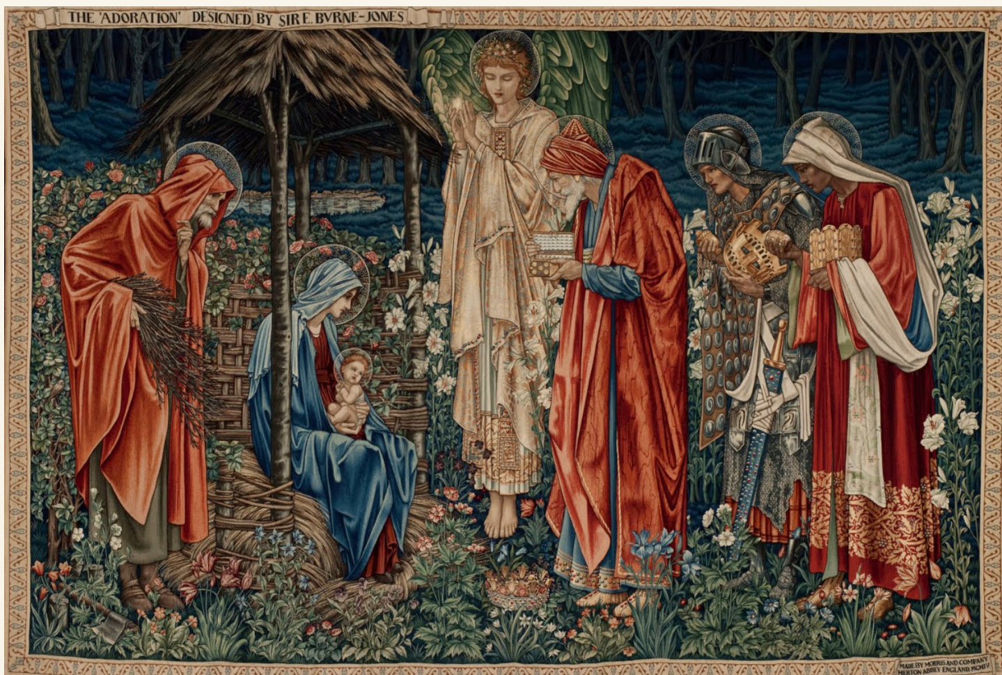
"The Adoration of the Magi," Edward Burne-Jones 1904, Musée d'Orsay, Paris, France.

Philip said to him, "Master, show us the Father, and that will be enough for us." - John 14:8