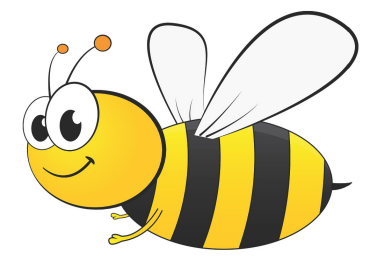
Congratulations to SSPJ's top 6 spellers who will advance to the Zone 5 Spelling Bee in March!