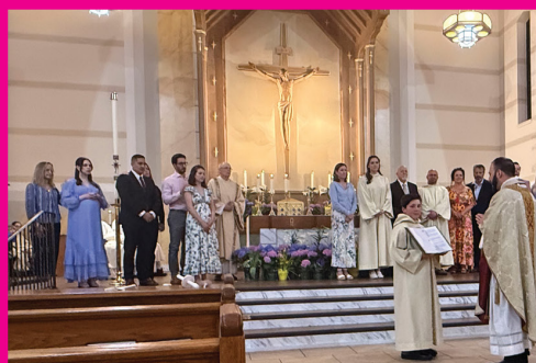
THE OCIA CANDIDATES AND THEIR SPONSORS AT THE EASTER VIGIL 2025