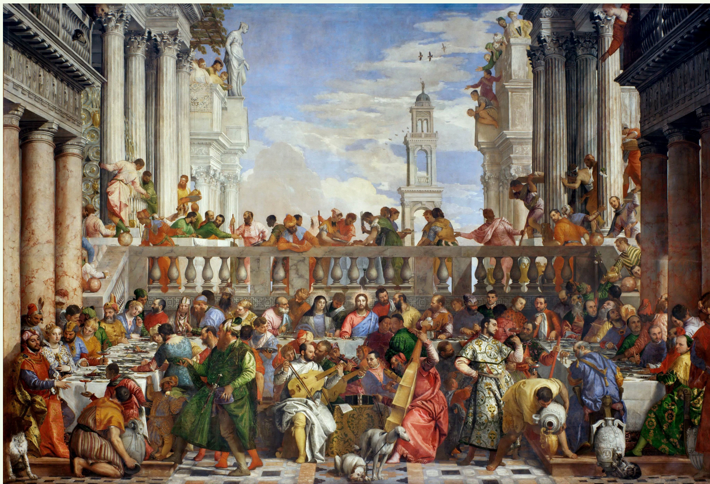
The Wedding at Cana, Paolo Veronese, 16th Century, Paris, France, France.

Philip said to him, "Master, show us the Father, and that will be enough for us." - John 14:8