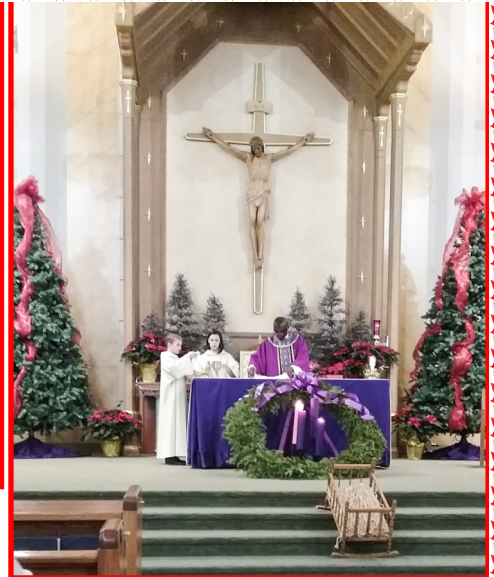
The first grade students performed a beautiful tableau on the birth of Jesus Christ our Lord.