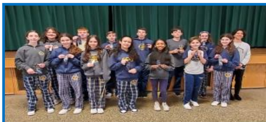
Principal's List - Trimester I 2023-2024

GREAT JOB SSPJ SCHOOL HONOR ROLL STUDENTS!